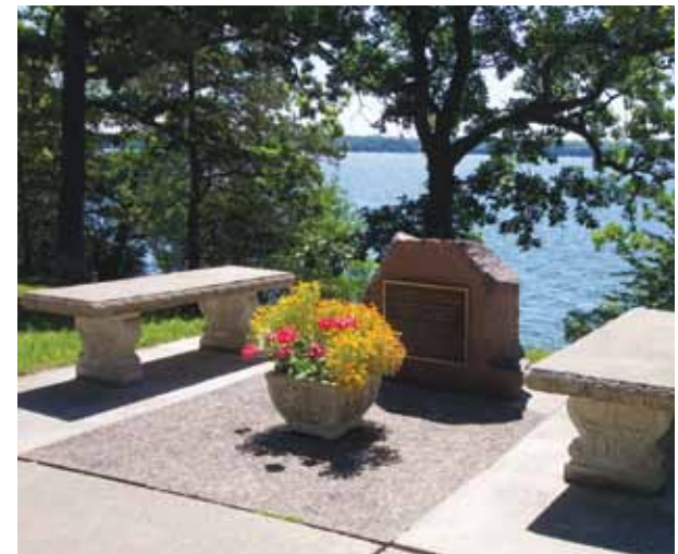
15" x 18" bronze plaque placed on a large patio stone: $15,000