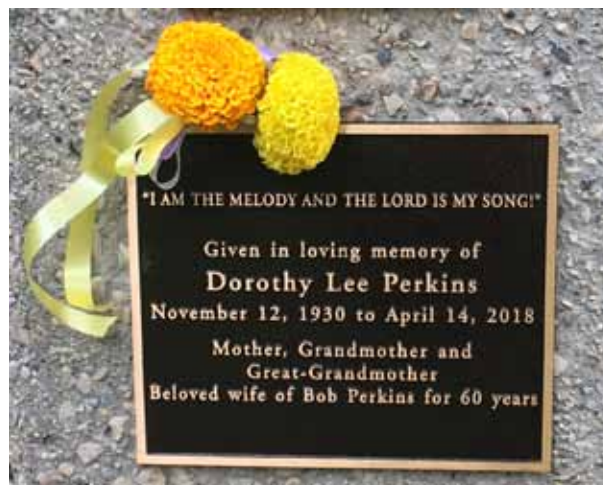
12" x 10" bronze arbor plaque: $5,000