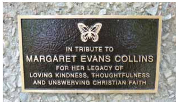
5" x 9" bronze arbor plaque: $2,500