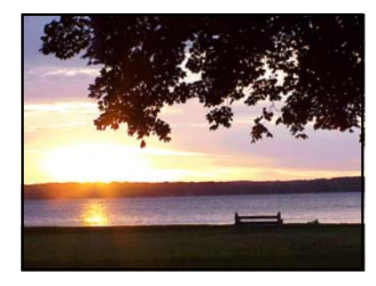
"For the dawn of a new day and a new generation."

Wise estate planning means preparing now for the management of your resources at the time of your death. Careful estate planning is a way you can care for yourself and for others. It makes possible the continuation of your Christian influence beyond your life, enabling you to continue supporting ministries that are significant to you.